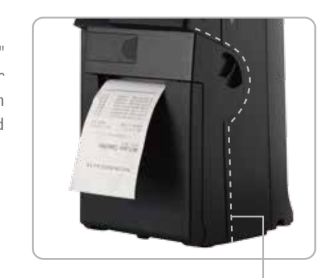
Detachable Receipt Printer •

The HS-3500-G2 Series integrates the most widely used peripherals including 3" thermal printer, MSR, fingerprint sensor, 2D barcode scanner and 2^{nd} customer display to support your daily POS operation. The detachable modularized design allows quick access to the components, enabling fast and easy service and upgrades.