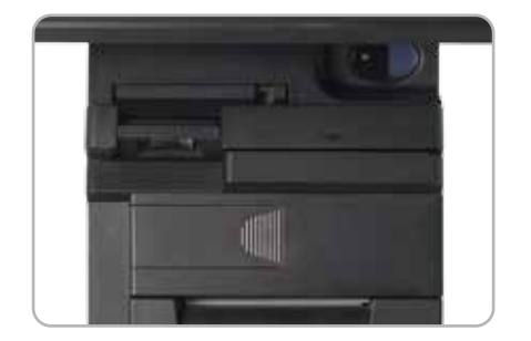
Optional Built-in MSR Fingerprint Sensor and RFID Reader