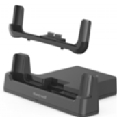
EDA10A-DB-0 EDA10A-DB-1 EDA10A-DB-2 EDA10A-DB-3 EDA10A-DB-5

Single charging dock for EDA10A with or without protective boot, compatible with hand strap. Kit includes: dock, convertible adapter cup (EDA10A-ADC), USB charging cable, 5V 2A power adapter, and plugs for US, UK, AU, EU, IN.