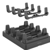
EDA10A-CB-0 EDA10A-CB-1 EDA10A-CB-2 EDA10A-CB-3 EDA10A-CB-5

EDA10A four (4) battery packs (EDA10A-BAT). Kit includes: charging base, power supply and power cord (-1 for U.S., -2 for Europe, -3 for UK, and -5 for AU).