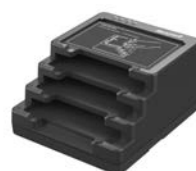
EDA10A-QBC-1 EDA10A-QBC-2 EDA10A-QBC-3 EDA10A-QBC-5

Ports: 3x USB-A, 1xHDMI, 1x RJ45 Ethernet.