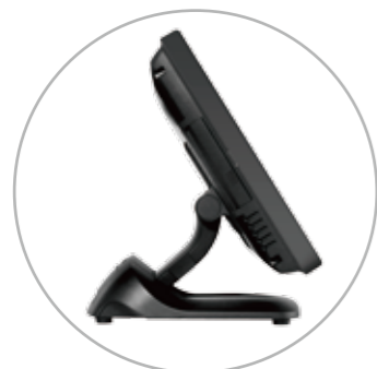
Full Extended Mode

The XT-3915-G2 provides the selection of two foldable bases, the curvy slim GEN7E base and the larger but practical GEN8E base. The foldable base can be configured into "Flat Folded Mode" to save the shipping package volume, "Low Profile Mode" to allow greater interaction between the cashier and the customer, and the traditional "Full Extended Mode". All this can be achieved with a simple pull of the hidden lever.