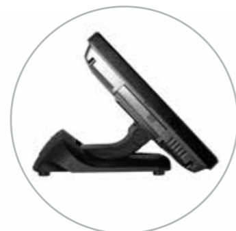
Low Profile Mode