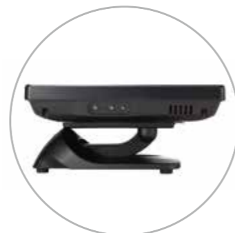
Flat Folded Mode